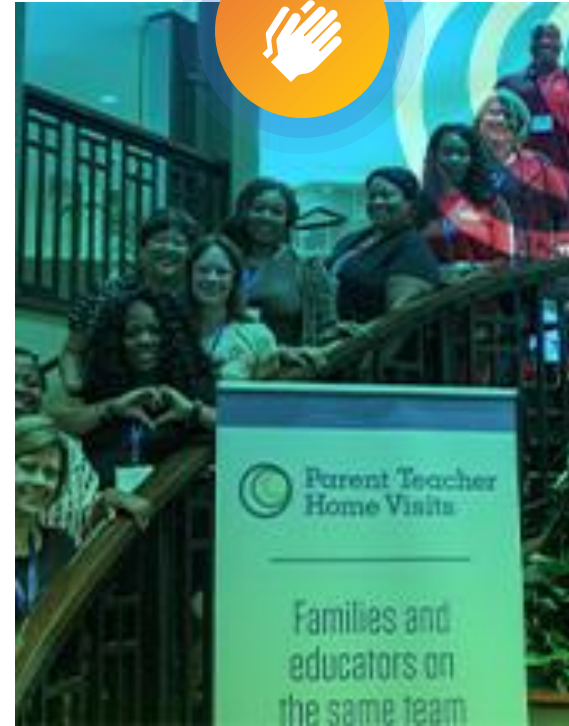
Celebration Reception 2023 IEL Family Engagement Conference