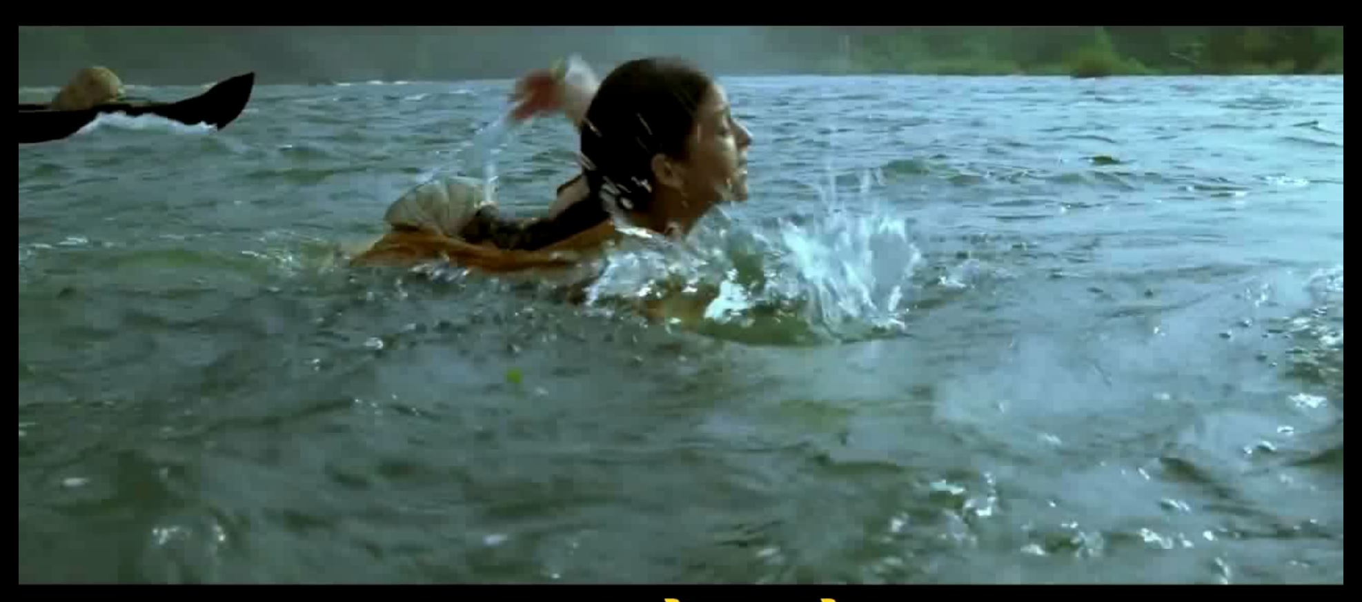
पार वाले पर ले